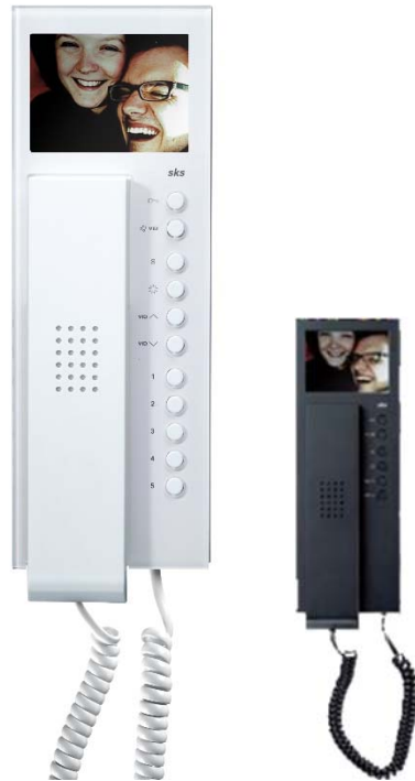
HTV4600 – SKS video intercom with receiver