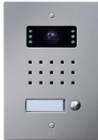
Elegantly designed indoor station (Material brushed stainless steel)