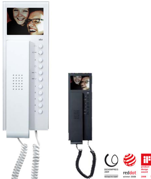
HTV4600 – SKS video intercom with receiver